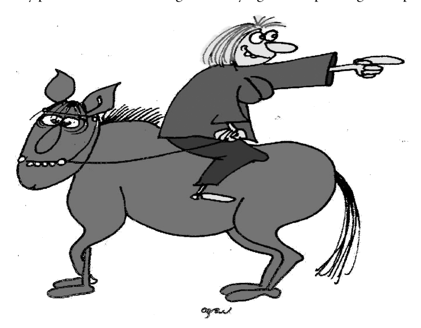
FIGURE 2: The survey may be a foundation for participation in the planning.

The knowledge basis that is presented in the class is also a suitable basis for discussing which topics that should be focused during the rest of the time devoted to the theme 'democracy' in the class. Here the students' opinion should be taken into account. They may be invited not only to voice their opinion on the content, but also on learning methods to be used. Logically they should also be encouraged to take actively part in decision making and carrying out the plans agreed upon.