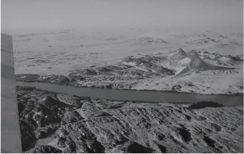
Fig. 1. Stretch of Batn el-Hajar showing mountains and the narrow river-bed.

the second feature of the refuge area warrior adaptation: relatively high population density in areas with low carrying capacity.