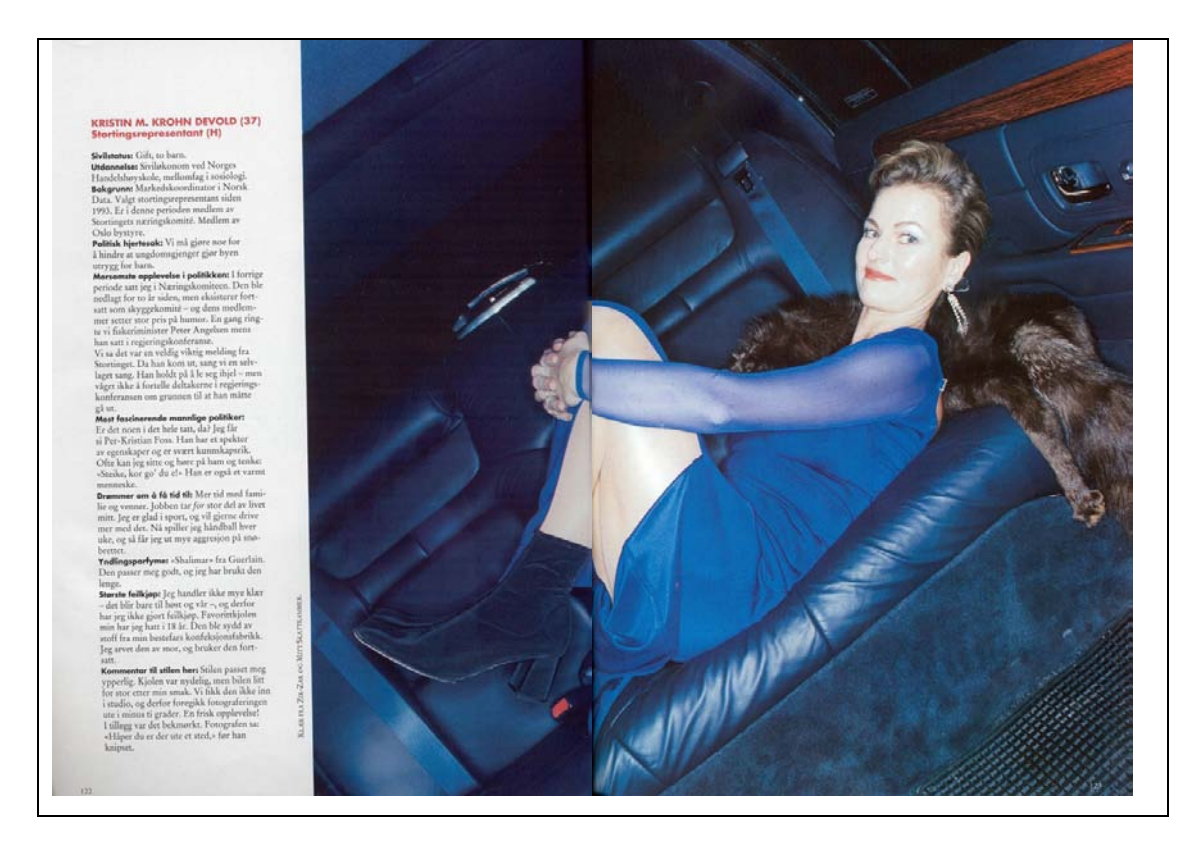
Facsimile 10 Kristin Krohn Devold (Conservative) in the rear seat of a limousine where she posed for the photographer from Henne no 2 1999.

VG 's journalist had got hold of the photo because this was an ideal subject for VG . The other big national tabloid Dagbladet works by and large according to much the same logic as VG . Dagbladet is also ready to clear its columns whenever politicians pose in a racy manner for glossy magazines or behave like clowns on prime-time TV on Friday and Saturday evenings.