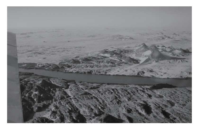
Fig. 1. Stretch of Batn el-Hajar showing mountains and the narrow riverbed.

the second feature of the refuge area warrior adaptation: relatively high population density in areas with low carrying capacity.