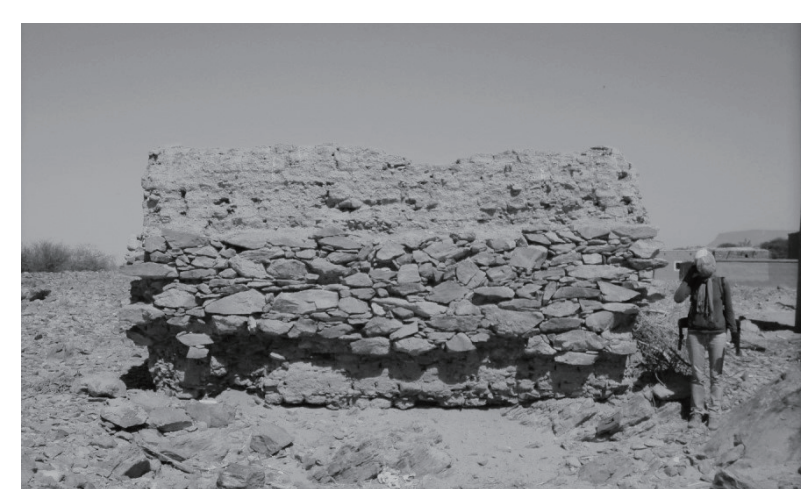
Fig. 2a-c. Probable tower-houses on Sai Island recorded by the Medieval Sai Project in 2009. a: Site 8-G-510; b: Site 8-G-503; c: Site 8-G-509.