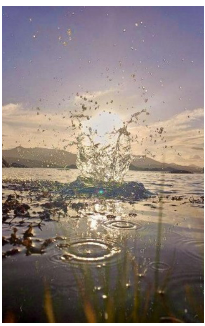
Student photo - Art Program B

The teacher would prefer an intensive week, where you leave out all other subjects and focus only on the art program. He believes that it would have given a better focus and greater intensity to the program and that it would have been easier for him to organise the program then.