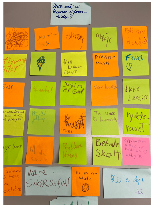
Students Evaluating - Art Program A: What do we need to be able to do in the future?

What the students enjoyed most about participating in the art program was working in groups with an artist. This points to the fact that the last part of the art program, which consisted of four different workshops where the student's worked in groups based on interests together with an artist, is what appears to be the most productive for most of the