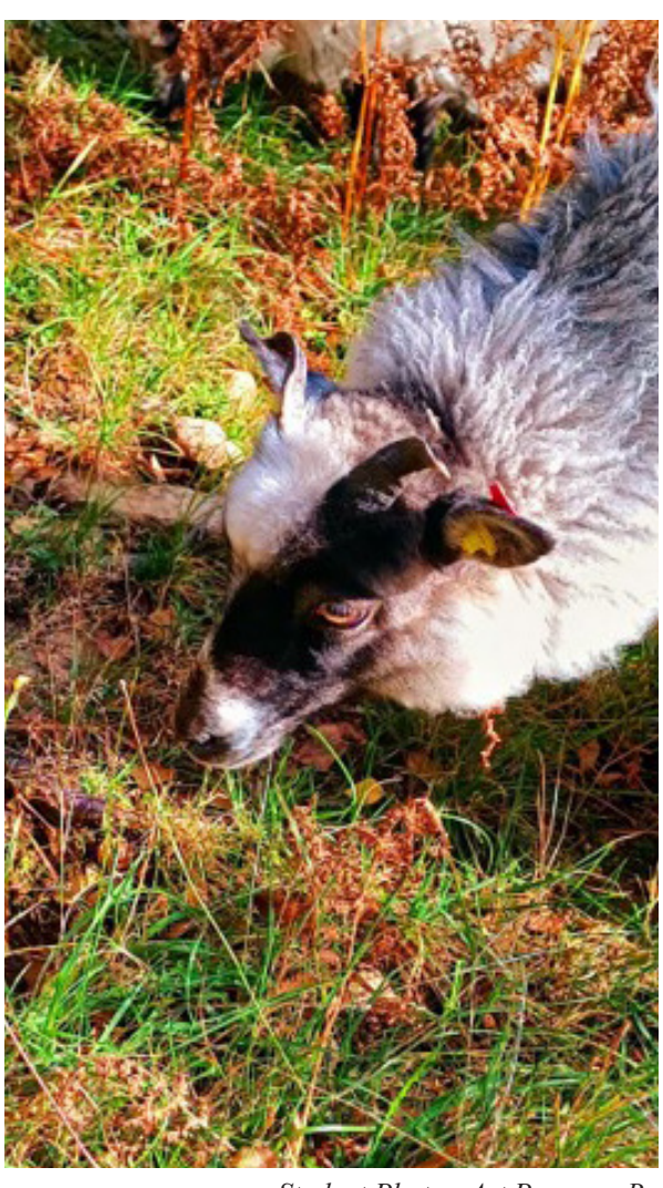
Student Photo - Art Program B

The art teacher had led other art programs in advance of Art Program B, both in primary and secondary school. Therefore, he had some experience with what worked well or not so well. Although he had made a detailed outline for the work, he was open to the possibility that this could be changed in collaboration with the teacher and/or experiences during the process. He wanted the practical exercises to provide a certain amount of freedom, but at the same time believed that clear and defined frameworks are important so that the students can get started quickly and avoid unclarity of expectations. In the end, the teaching artist had arranged for a "premiere" where the students presented their photo story, other pictures they were proud of and wanted to share, and finally one selected for Seanse with a comment about why they had chosen this photo. After each presentation, the students received feedback from both the teaching artist and fellow students. (In this feedback process the class teacher was not present).