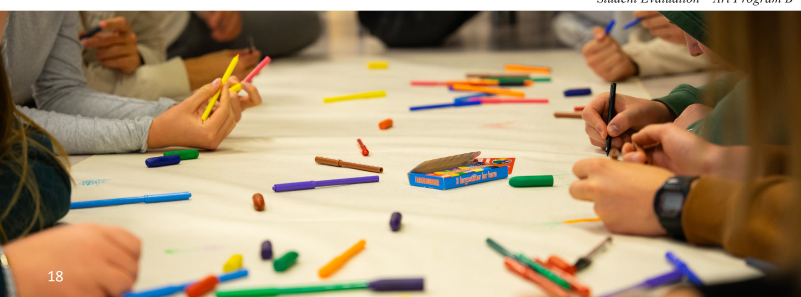
Student Evaluation – Art Program B

The teaching artist experienced the collaboration with the teacher as very good. He describes the teacher as interested, positive, and benevolent. Especially in the planning phase, the communication with the teacher was very good. Due to various factors, for instance sick leave among the teachers and some students, there were changes in the plans along the way. During the actual implementation, the artist was left alone with responsibility for the class on certain days. Substitutes were put in for class teachers, but they did not know the scheme and therefore did not become real partners in the scheme itself. This was experienced as somewhat chaotic for the artist in relation to changes in the planned activities, keeping track and reorganising the art program. He himself experienced that he had to become "more of a teacher" than he wanted. This means that there was less time to guide and work together with each individual student's artistic product because part of the time was spent organising and keeping order in the class. The artist had wished that the collaboration could have been even closer in the implementation itself. This is not least because he sees a potential for the teacher in using the experiences from the art program in further teaching. The yield would have been greater if the teacher could have been present during the students' presentations on the last day of the program, he believes.