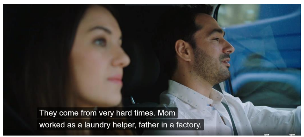
Figure 5 - Norsk-ish Episode 3 – 19:04

Returning to our topic, since the agreement with Federal Germany opened the doors to migrating from Turkey to the West, about 100,000 Turkish people have migrated to European countries annually since 1961 (TÜSĠAD, 1999). Korhan (2014) suggests that from the late 1970s, Turkish migrants gradually came to Norway; some of them could not 'make it' in their first host country, for instance, Germany, and some came directly from Turkey. 'Norway was one of the preferred secondary destinations because of its open society, low unemployment, and high wealth (Korhan, 2014; p.48). Turkish migrants gradually came through chain immigration – a form of migration where people facilitate and help their friends and family to immigrate – and family reunification – joining the first-degree family members. Korhan (2014; p.81) argues that while there have been different forms of migration from Turkey to Norway, chain immigration is the most common style of migration that Turkish people use to enter Norway.