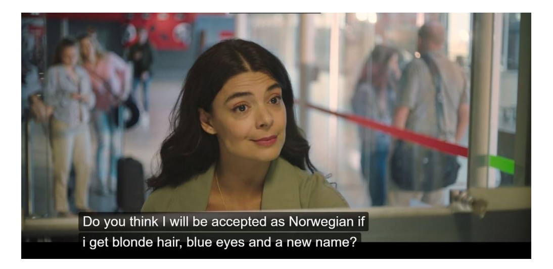
Figure 2 - Norsk-ish Episode 1 - 01:05

seems confused and shocked, says, 'What I am just wondering is with which plane you came today?