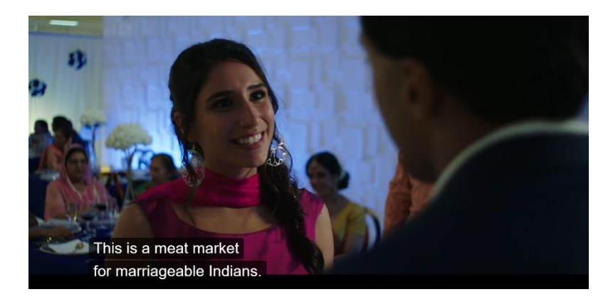
Figure 6 - Norsk-ish Episode 5 – 04:43

Therefore, the wedding ceremony is seemingly more than what Amrit calls a "meat market" (Figure 6) – an informal term meaning a place where one goes to find a casual sex partner. Amrit suddenly stops his conversation with one of the girls when he sees Deepi -the girl he had some flirting scenes with in prior episodes- from afar.